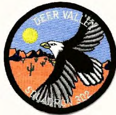
Symbol of a Half Century of History — Shown above is the emblem of Deer Valley Composite Squadron 302.